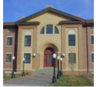
Our Lady of Guadalupe Seminary

Engineering Technologies, Inc. is currently designing Phase II of the project which consists of a 51-Room Dormitory Addition. Phase III, the Chapel Addition of the project, is scheduled to begin next spring.