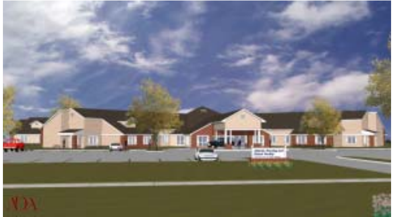
Atlantic Nursing Care Facility (Rendering provided by Architectural Design Associates)

ETI provided complete engineering services for this new 39,200 ft 2 , 100-bed assisted living facility in Atlantic, Iowa. This facility includes both private and semiprivate rooms, complete kitchen/dining area, nursing areas, commons area and separate laundry facilities. All HVAC systems were required to be balanced to maintain pressure relationships between "dirty" and "clean" areas. In addition a nurse call and Wanderguard system were incorporated into the facility. The facility is expected to be completed in April 2004.