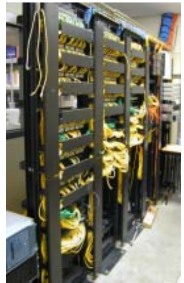
North Star High School Computer Network System

If you would like additional information on any of these technologies, please feel free to contact our office.