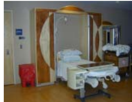
Labor & Delivery Room