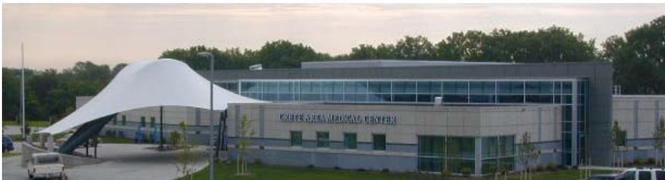
Crete Area Medical Center Exterior