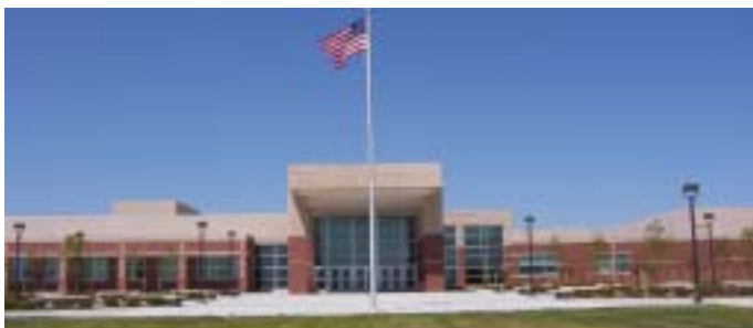
North Star High School