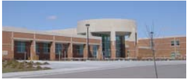
Southwest High School

Each school has a 3000 amp, 277/480 volt heating service, which allows the school to take advantage of the utility company's reduced heating rates, a 4000 amp, 277/480 volt, general service and a 150 kw emergency standby generator for essential and life safety emergency loads. Each school also has an addressable, ADA compliant fire alarm system that is integrated with a voice evacuation system for the gymnasiums, theater, swimming pool and large commons areas. The buildings use a voice over IP telephone system that is distributed over the computer networking system. State-of-the-art connectivity systems were designed by our firm and contain over 1,600 individual data drops terminated in seven data rooms. Fiber optics connect all data rooms and serve as a hub for other LPS schools reducing the need for outside telephone lines. In addition, intercom, clock, and class tone were integrated into one complete system.